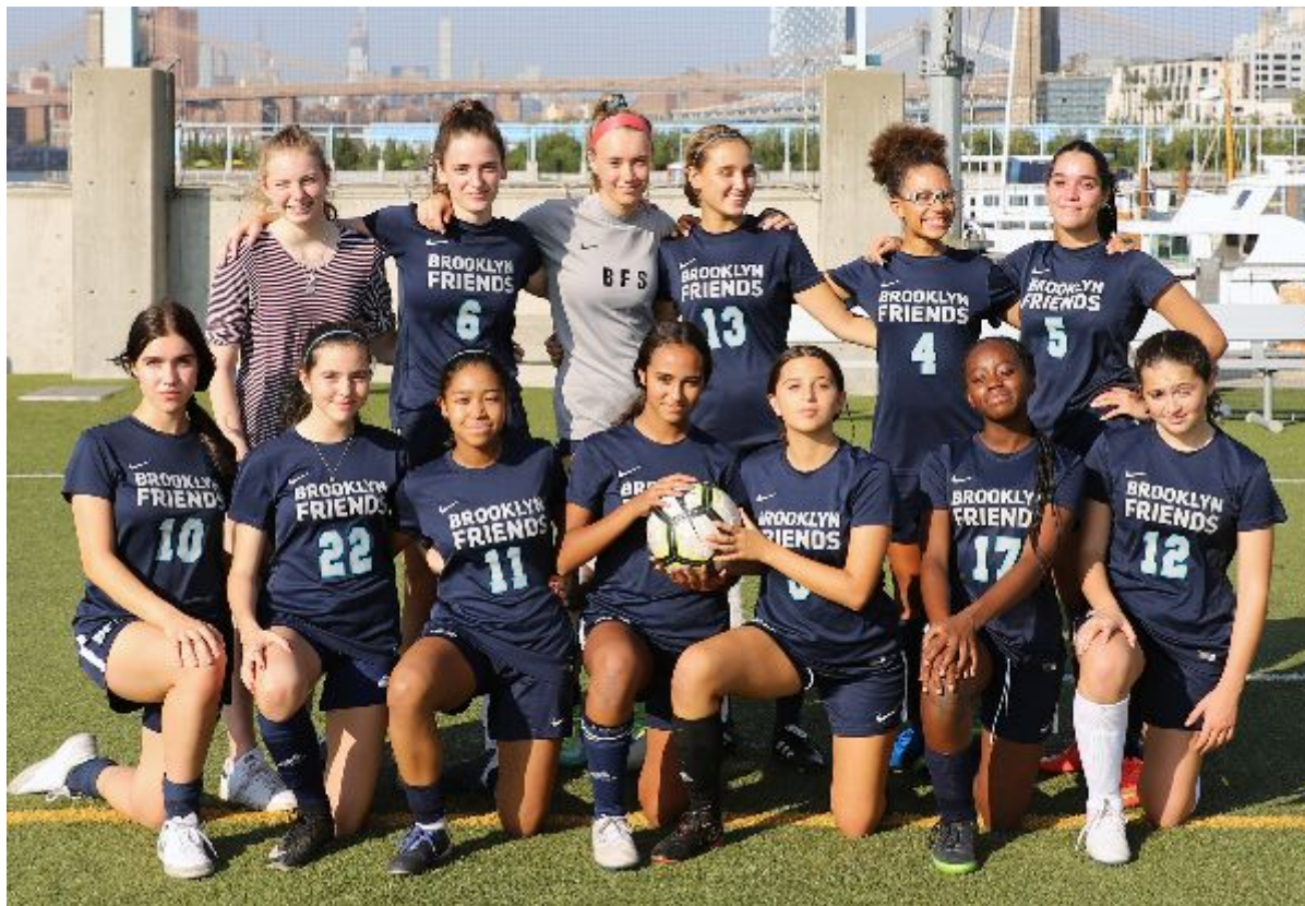
Varsity Girls Soccer Team

You can be a Panthers fan too! Enjoy the beautiful fall weather at a BFS soccer game and take an elevator ride to the upper gym to see our spirited girls volleyball teams in action in the next few weeks. See the schedule and sign up for a fan alert at bfsathletics.org .